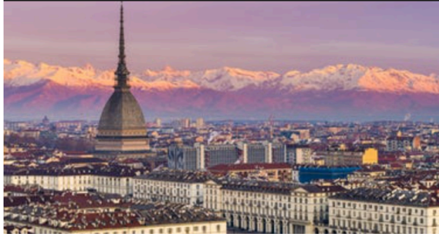
The 'Mole Antonelliana' in Turin.