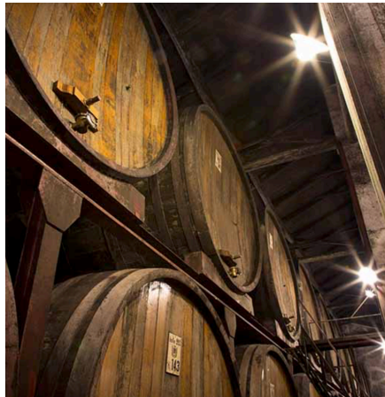
Fontanafredda, royal wine cellars