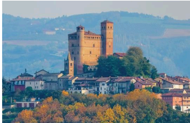
Serralunga d'Alba castle.