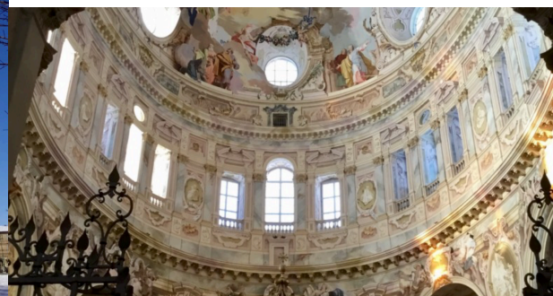
Sanctuary of Vicoforte and the dome.